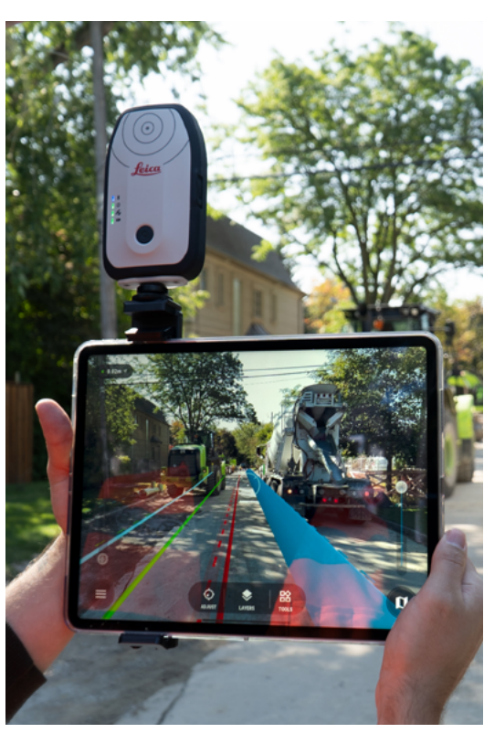
vGIS with the Leica Zeno FLX100 plus